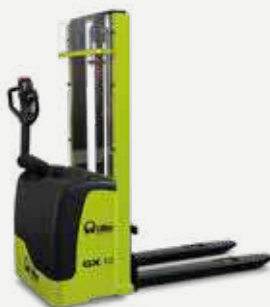
GX Designed for professionals, made for every need