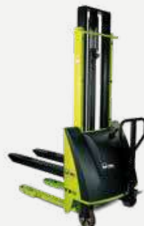
TX Manual traction and electrohydraulic lifting technology