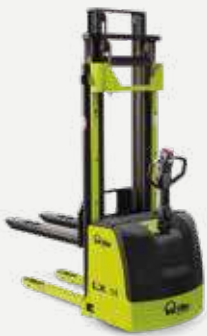
LX Strong and reliable full optional stacker