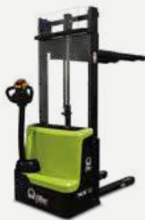
NX Reliable performance for professional needs