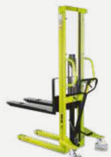
MX Robust and resistant manual stacker, simple to use